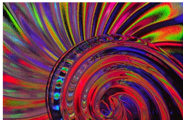
MASTERS SLIDES "BACKLIT GLASS PLATE" Nellie Bretherick