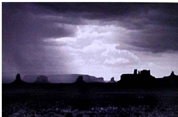
MONOCHROME PRINTS "MONUMENT VALLEY STORM" Gary Kelly