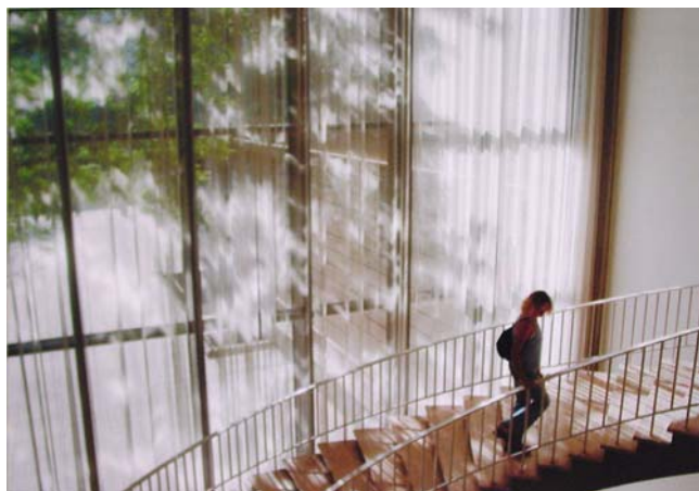
BEGINNER PRINTS "STAIRWAYFIELD MUSEUM CHICAGO"