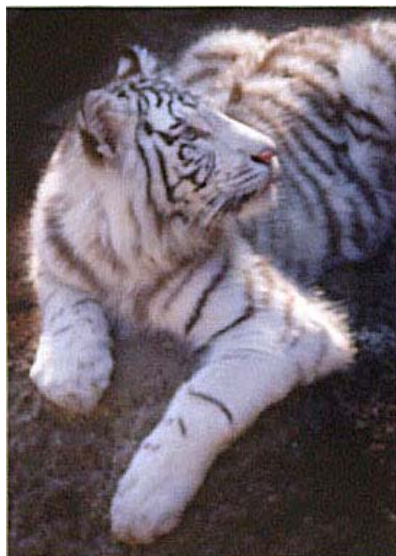
MASTERS PRINTS "YOUNG WHITE TIGER, STAR" Paula Buzenius