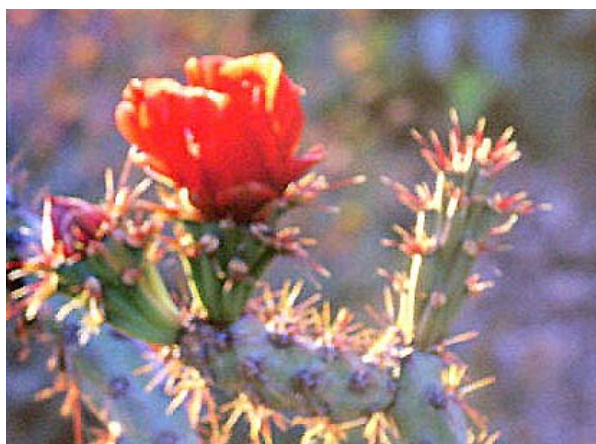
ADVANCED PRINTS "CACTUS GLOW" Dan Meredith