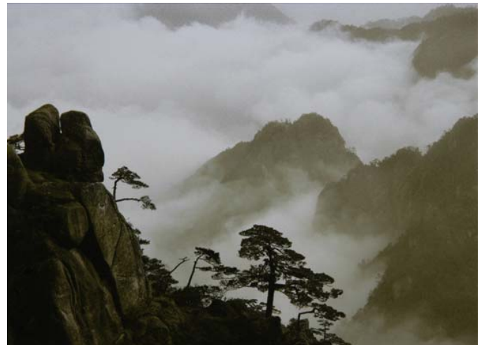
MONOCHROME PRINTS "YELLOW MOUNTAIN IN CHINA" Eleanore Avery