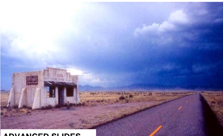
ADVANCED SLIDES "LAST OASIS" Jim Broadwater