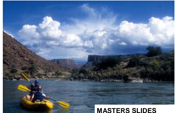
MASTERS SLIDES "RAFTING IN UTAH" Nellie Bretherick