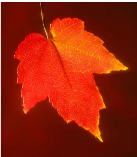
MASTERS SLIDES "MAPLE LEAF" Clark Crenshaw