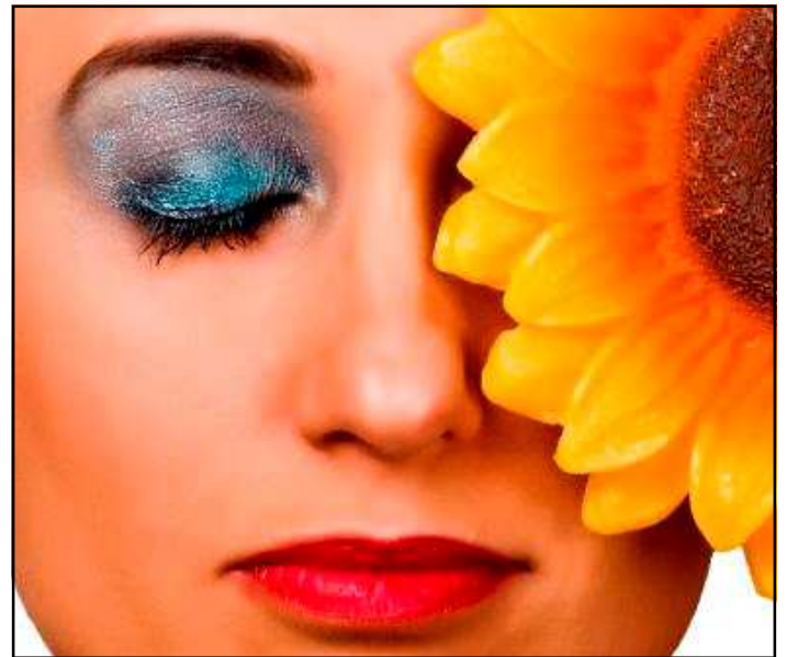
Second Place Beginners Projected Images “Self Portrait—Color Games” By Agnieszka Szczurowska