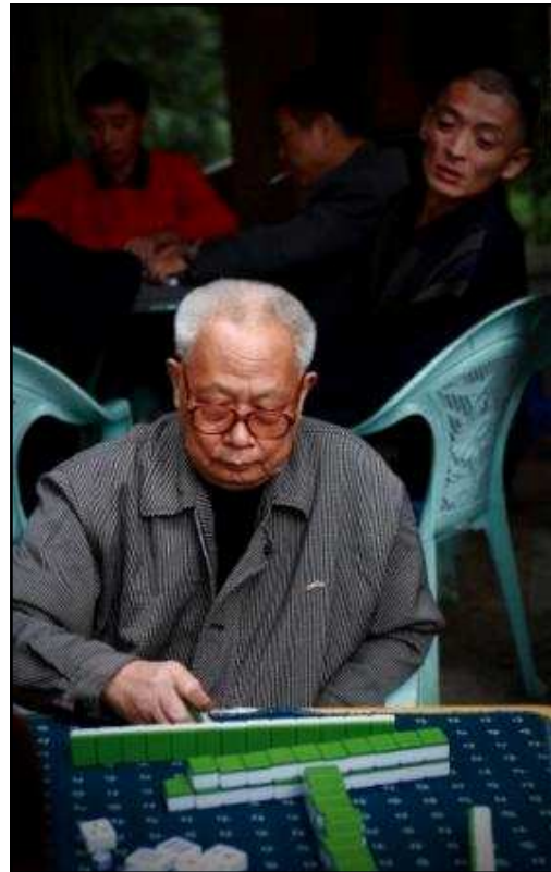
Second Place Beginners Color Prints "The Snoop" By Gary Cowles