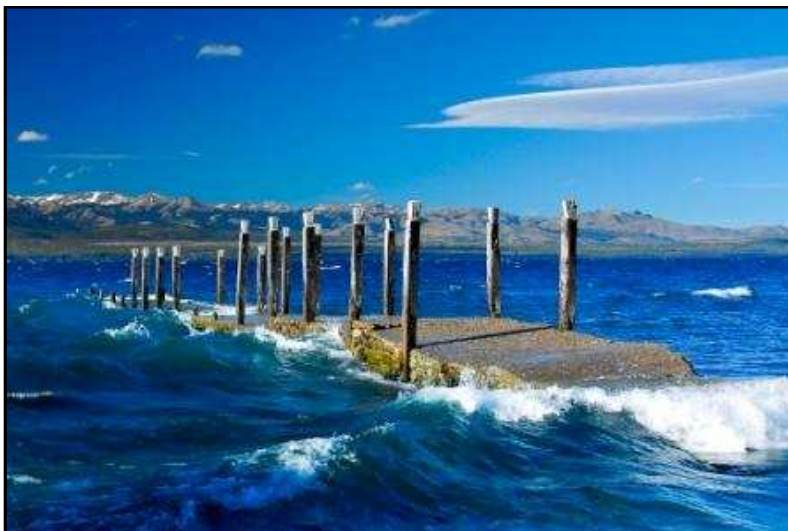
Third Place Beginners Projected Images “Power Plant” By Steven Burt