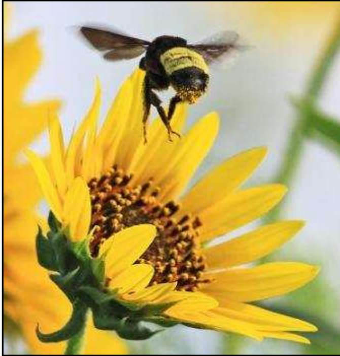
First Place Beginners Projected Images “Yellow Bumble Bee!” By Caren Mack