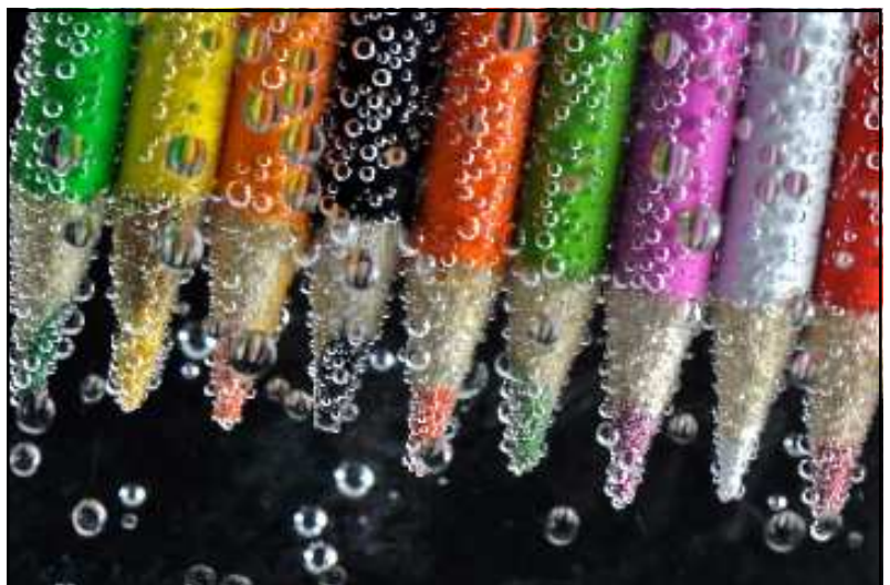
Second Place Masters Color Prints "Tiny Bubbles" By Rolando Solis