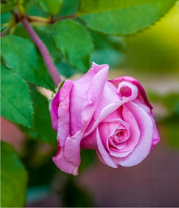
Images from Clark Gardens