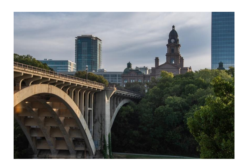
Old Factory North West Corner of Main St and Trinity River (from river level)