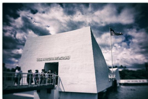
Trio 28 Lens