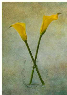
Velvet 56 Lens