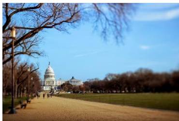
Edge 50 Optic