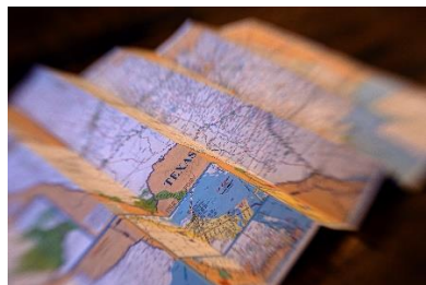
Sweet 50 Optic

Flickr, YouTube, Instagram – put “Lensbaby” in the search bar