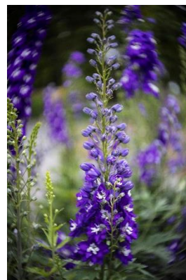
Twist 60 Optic