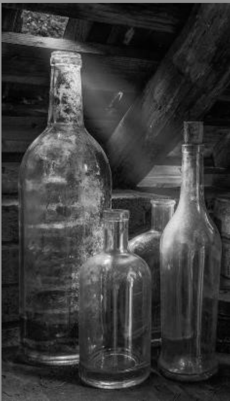
1st Still Life Monochrome