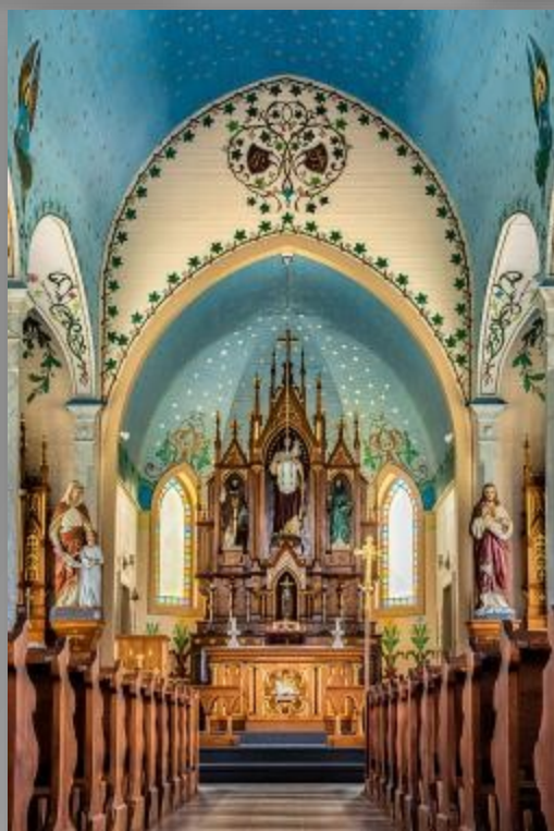
2nd Color Architecture