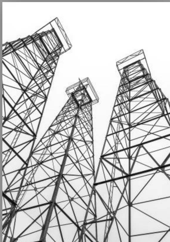
2nd Rural City