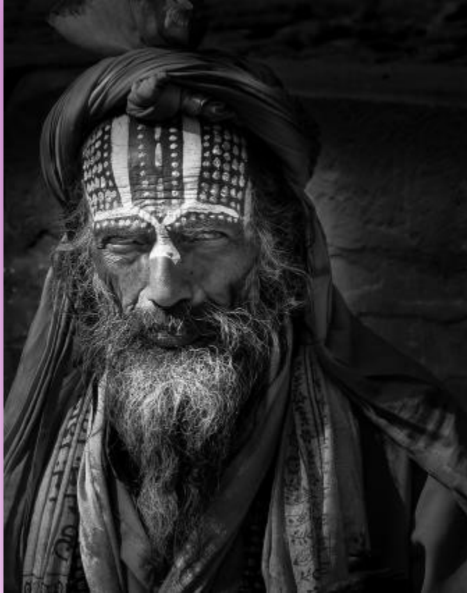
Masters Mono Projected