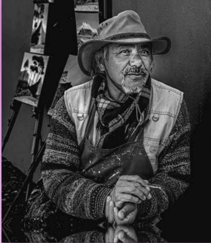
Advanced Mono Projected